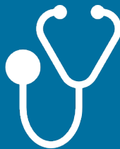
Physicians & Professionals